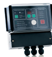
BW-800 in Wall Mounting Box 810 IP65